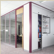
EMF finished in grey MFC originates with Møgelgaard's design.

The diverse uses of EMF are evident in this case: lateral and pull-out filing, shelving, wardrobe, glass display units, parts doors and audio-visual equipment.